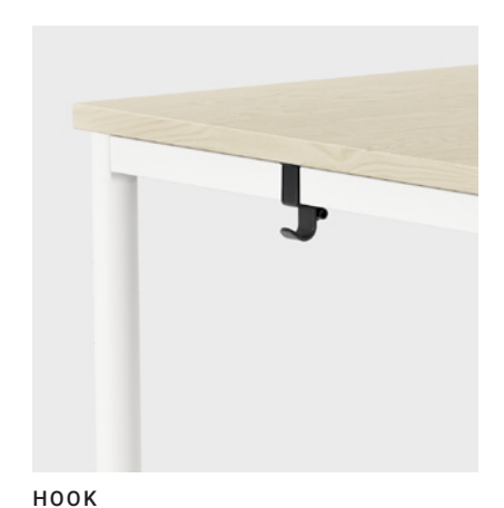
Hook as standard, for bags and similar. One hook per seat.