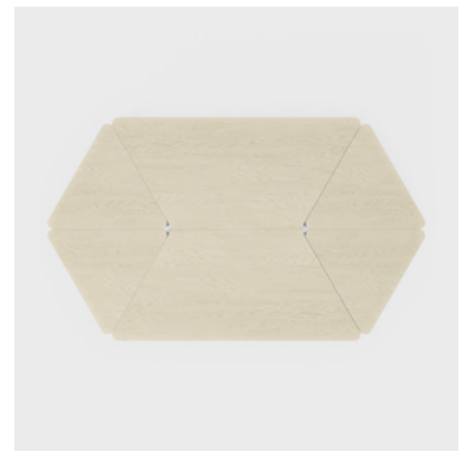
DIFFERENT TABLETOP SHAPES

QUICK CONNECTOR An easy-to-use connector that makes it quick and easy to create new desk combinations where the tops fit closely against one another.