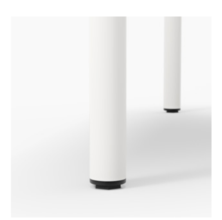
FLOOR LEVELLING Legs with levelling screws compensate for uneven floors. Manually adjustable up to 15 mm.