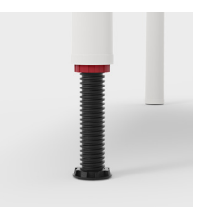
LEGS - ADJUSTABLE HEIGHT Adjustable height legs, 20 cm. 62-82 cm or 83-103 cm. Castors add 70 mm in height.