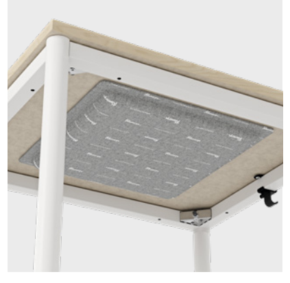
SOUND ABSORBER An optional sound absorber can be fitted under the tabletop.

The tables are available with rectangular, square, round, triangular and trapezoidal tops in several sizes. Vary shapes to easily rearrange in different combinations and to support different activities.