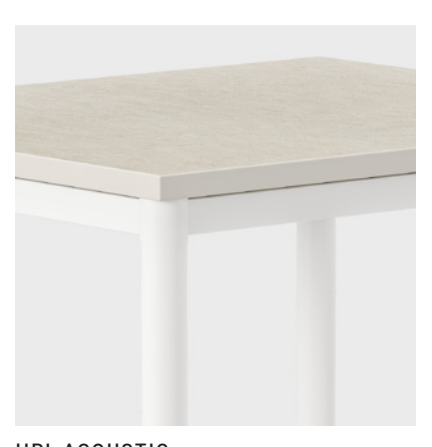
HPL ACOUSTIC Sound-dampening acoustic top with cork core and high-pressure laminate for a better acoustic environment.