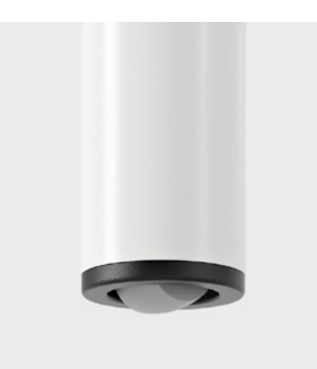
INTEGRATED MICRO CASTORS Fixed height tables are available with integrated micro castors for smooth and silent movement.