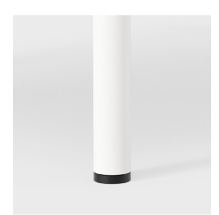
LEGS - FIXED HEIGHT Fixed height legs: 60 cm, 72 cm or 90 cm.