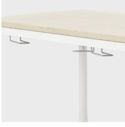
SUSPENSION ARCH FOR EDUCATION CHAIRS Fitted under the table and facilitates cleaning.